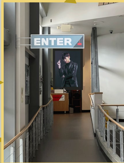
Raven as Guide