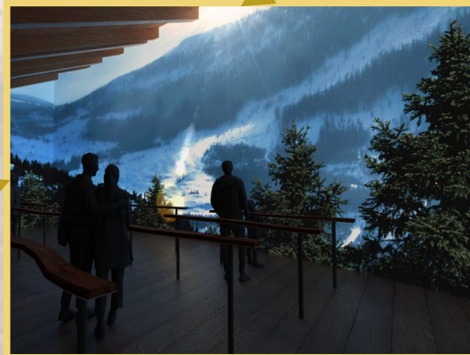
Raven Clan House