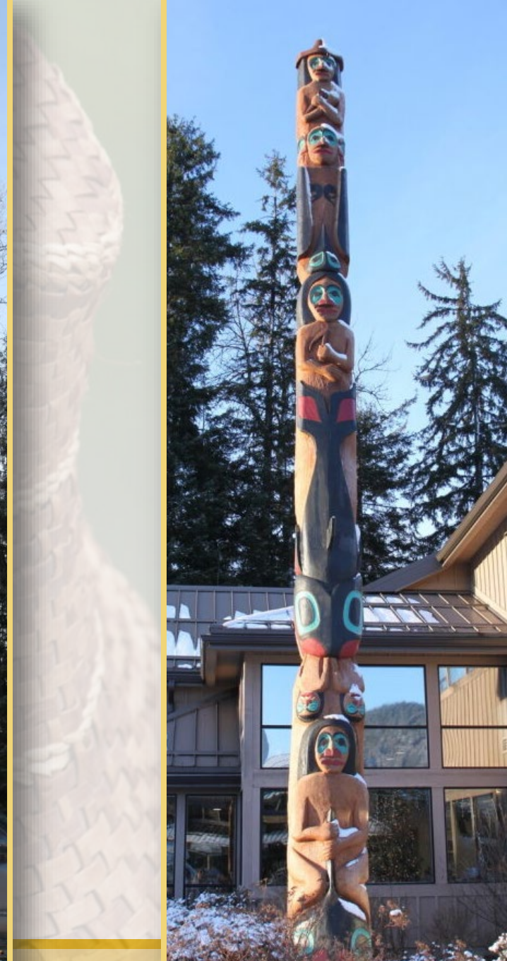
Creation of Killer Whale