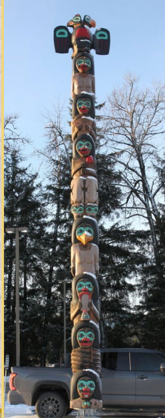
Legends and Beliefs