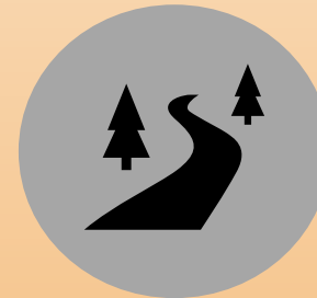
MANAGING ROAD IMPACTS