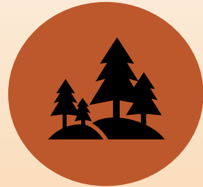
SEAK YOUNG GROWTH MANAGEMENT