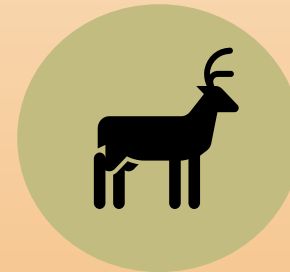
DEER, MOOSE HABITAT