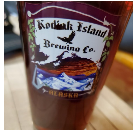
Kelp Beer from Kodiak!